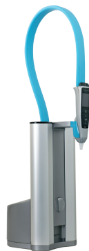
PURELAB flex 2