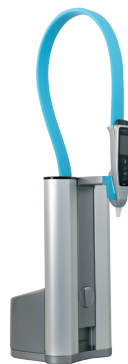
PURELAB flex 1