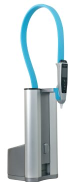
PURELAB flex 1