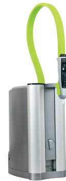
PURELAB flex 3&4