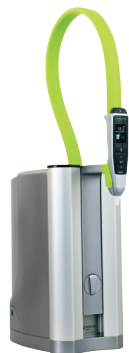
PURELAB flex 3&4